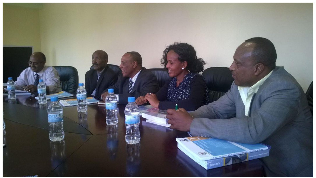
A delegation from Ethiopia in a study tour in Rwanda about DHS