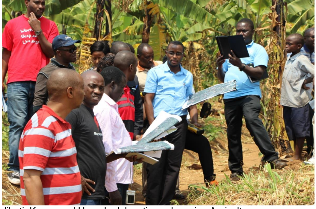
Jibuti, Kenya and Uganda delegations observing Agriculture survey